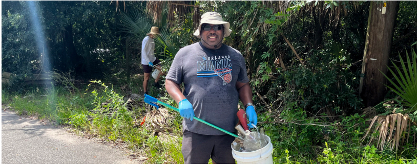
Rising Tides Cleanup of McCoys Creek, July 16

We love to help you Get Your Feet Wet along our river! Find upcoming events at StJohnsRiverkeeper.org/events .