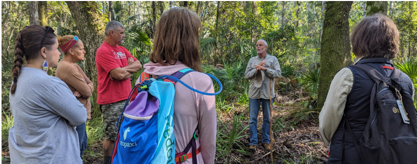
Wetland Preserve tour in Palatka, October 15