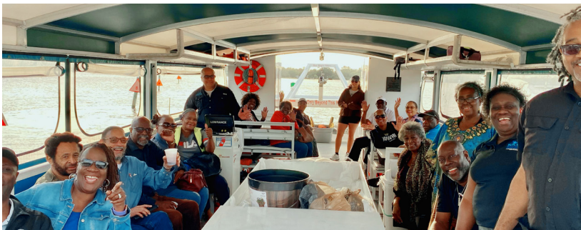
Resilient Ribault Boat Tour on the Ribault River, October 23