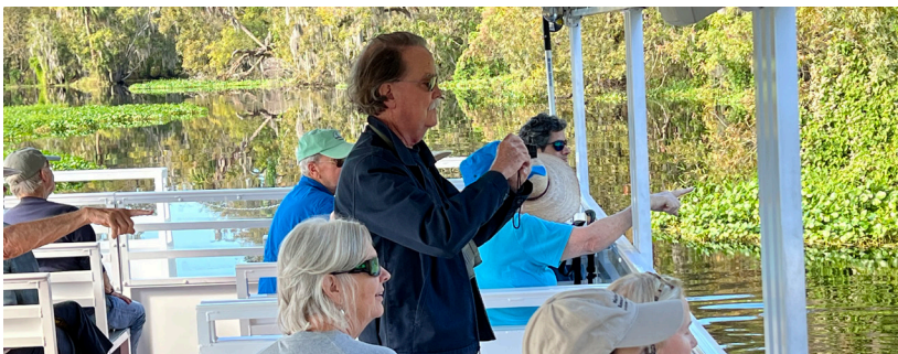
Eco-Heritage Boat Tour in the Middle Basin, November 10